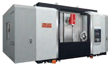
DMG MORI NHX6300

5 AXIS MILL TURN WITH LOWER TURRET X: 40.9"/1,040mm Y: 10"/255mm Z: 76.4"/1,940mm MAX L: 75.6"/1921mm PART DIA: 36.2"/920mm BAR CAP: 4"/103mm